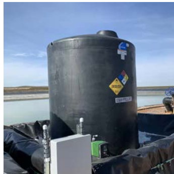
Automated Chemical Injection