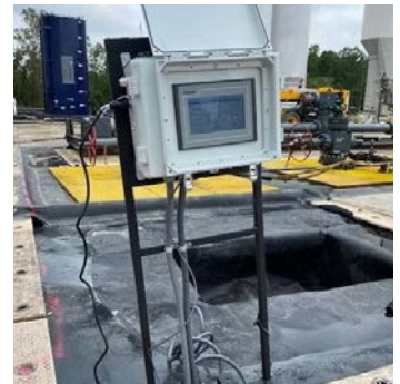
M.E.G.A Remote Leak Detection System