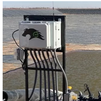
M.E.G.A Remote Water Monitoring System