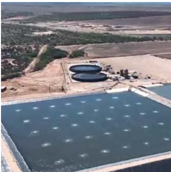
Aeration and Chemical Injection