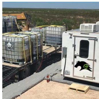
On-the-Fly Water Treatment