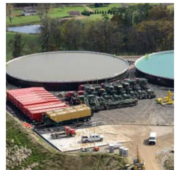
Recycle and Reuse